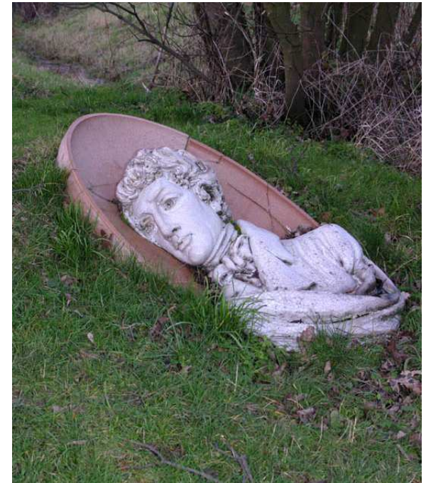
The bust medallion of Charles Lamb set into a bank in front of Button Snap